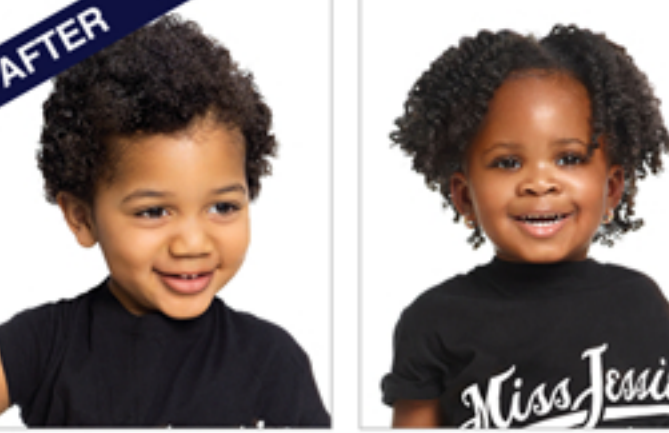
For manageable and moisturized styling try these products: